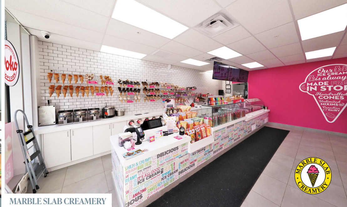
MARBLE SLAB CREAMERY