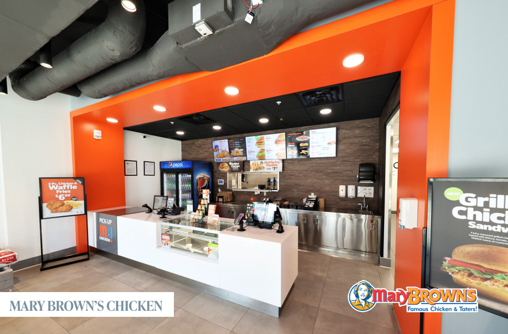
MARY BROWN'S CHICKEN